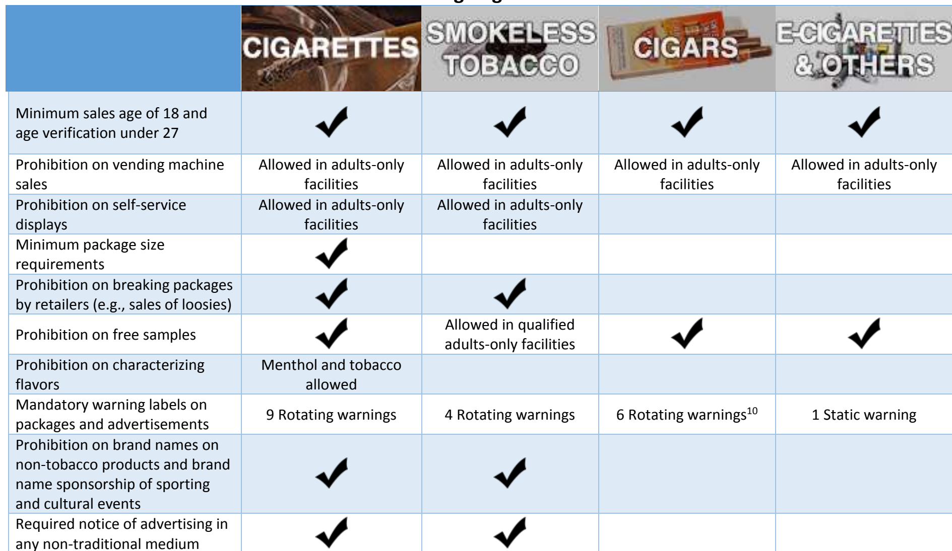
Table 2 Final Deeming Regulation Provisions